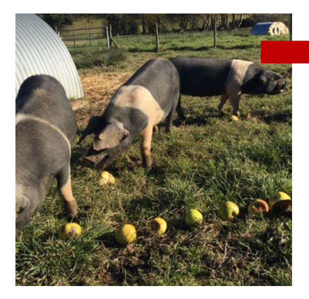
Step 4 Dishes made with Pork